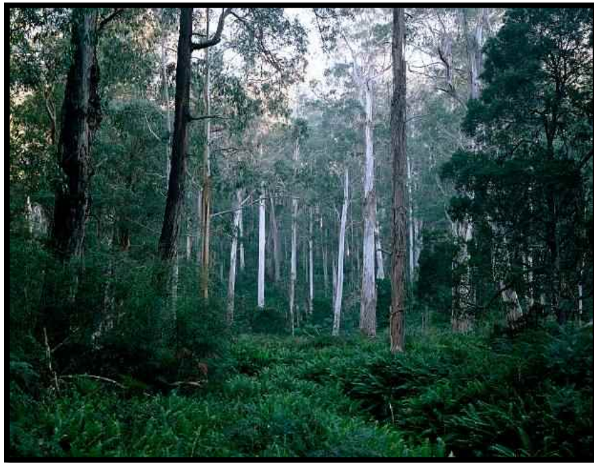
A stand of Eucalyptus cypellocarpa (Monkey Gum/Mountain Grey Gum)

The numbers are: m = elevation (height above sea level); mm = annual rainfall in millimetres.