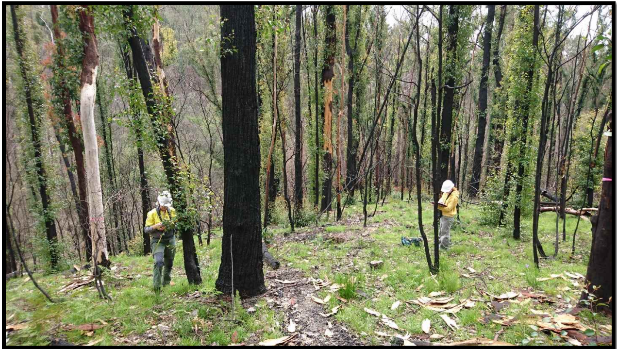
Eurobodalla Koala Project researchers in the Wamban Creek area, Deua National Park, 2020

There is substantial interest in the idea of koala reintroduction through translocation amongst the private property owners wanting surveys done, but there is also considerable naivety about the issue's complexities. Combined with a lack of specific knowledge amongst the general community, this indicates the need for enhanced public education as part of this recovery strategy.