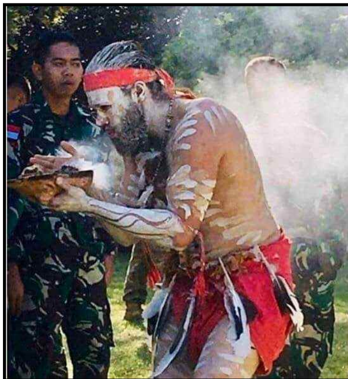
Smoking Ceremony at re-opening of Mogo Wildlife Park, February 2020

The volunteer Eurobodalla Koala Project works on Yuin country. The authors acknowledge local Elders and Local Aboriginal Lands Councils, not only for their significance as original and continuing custodians but also for their current initiatives such as the development of a cultural burning regime providing youth training and a service to private properties.